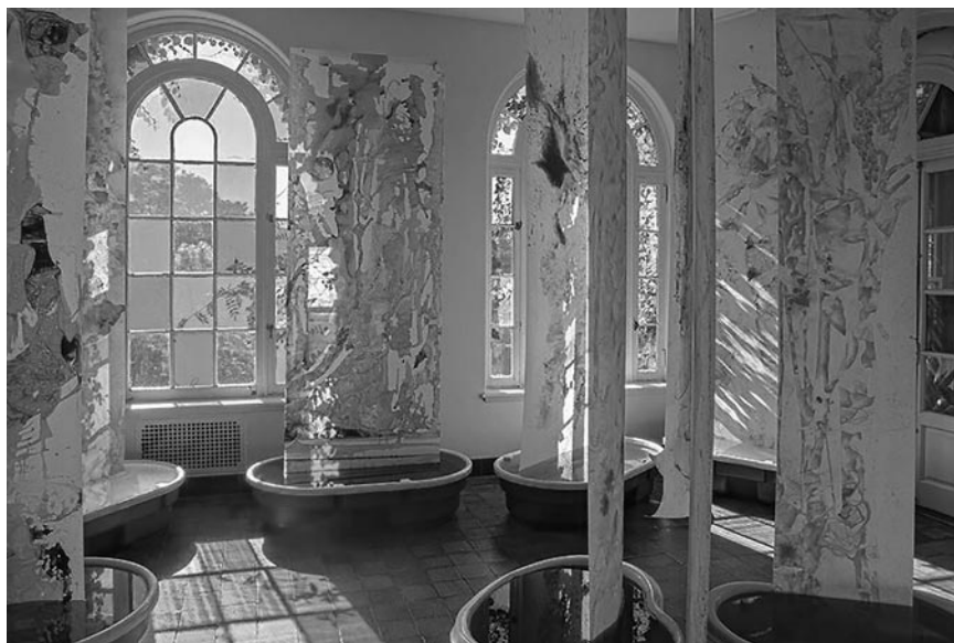
Fig. 2. Keren Anavy, Garden of Living Images (2018), detail, installation in the Sunroom Project Space, Wave Hill, the Bronx, New York, ink and colored pencils on transparent Mylar, polyethylene ponds, water, vinyl, dimensions variable.

landscape respectively. She thus traverses personal memories of displacement, longing, belonging, and unbelonging in gendered private spaces as well as in places of geopolitical and cultural convergence to imagine new social networks and geographies.