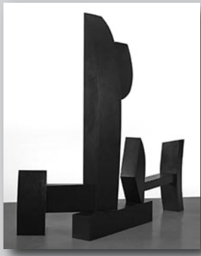
(Front cover) Dorothy Dehner, Prelude and Fugue (1989), painted black steel, 99" x 103" x 33".